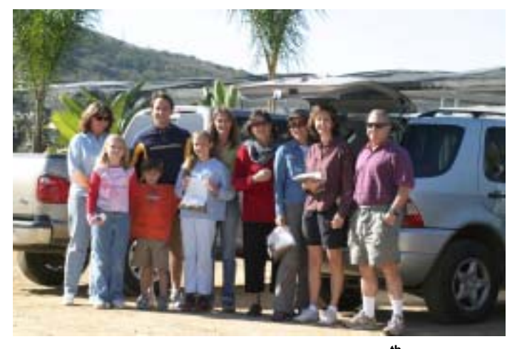
Elves turned out in force on November 6<sup>th</sup> to spread wildflower seeds along our roads, preparing for a glorious spring. It rained just a few hours later.

Cost Control Goes Up a Level: All at OMWD believe in controlling costs. The dam and treatment plant were funded with grants, participations with other agencies, and low interest loans. A hydroelectric system generates electricity which contributes a large portion of the cost of running the treatment plant. Another hydro-electric system generates electricity at the Miller tank. Carter's Hay and Feed and the dog training facility located on OMWD property rent their land from OMWD which generates income to offset costs. Nextel and Verizon pay the district a monthly fee for cell towers located on remote tank sites in the district. The employees have recently split into two groups and each group is challenging the other to provide more offsets like those listed above. It will be fun to see who wins! Donald Trump would be so proud!