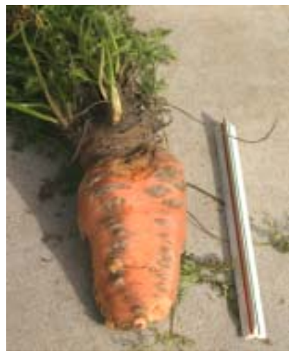
Don't forget to harvest or you'll end up with a mutant vegetable like this as a conversation piece. Carrot cake, anyone? From an EF garden.